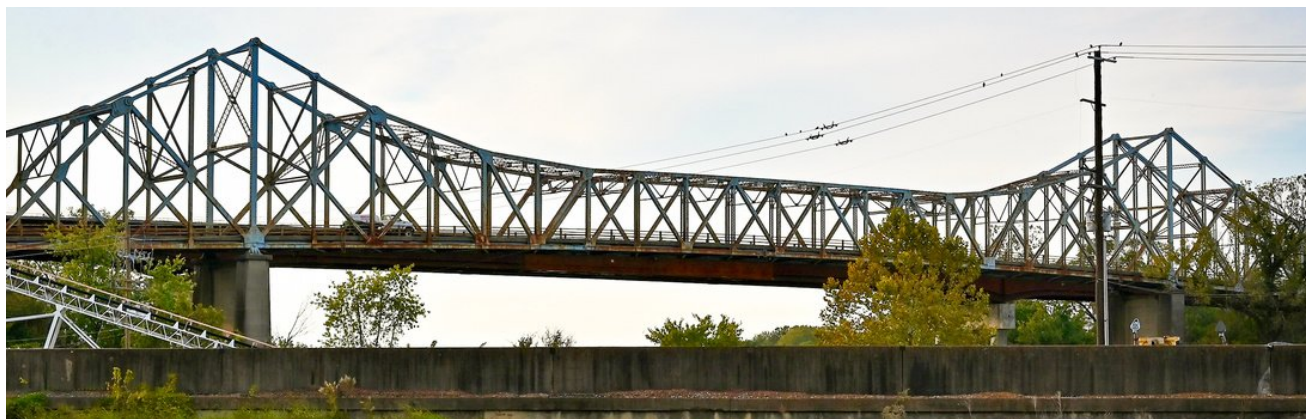
(Blue Bridge in Newport, Arkansas)

Demographically, Newport is 69.1% white, 20.4% Black, 9.4% two or more races, 2.9% Latinx, 0.3% Indigenous, and 0.1% Asian ( ACS, 2019 ). The city has a median household income of $30,398, as compared to the state median of $48,952. Twenty-seven percent of Newport residents fall below the poverty line, as compared to 16.2% of people across Arkansas ( U.S. Census Bureau, 2021 ). Only 69.3% of Newport households have a broadband subscription, and in the Comprehensive Economic Development Strategy (CEDS) for the White River Planning and Development District – the Economic Development District in which Newport lies – improving broadband access was identified as one of the top action items to be completed between 2020 and 2024 ( ACS, 2019 ; WRPDD CEDS, 2020 ). Furthermore, Newport has one designated Opportunity Zone within the city limits, and the only one within Jackson County – a designation created in 2017 that refers to "economically-distressed communities where new investments, under certain conditions, may be eligible for preferential tax treatment" ( IRS, 2020 ; OpportunityDb 2021 ).