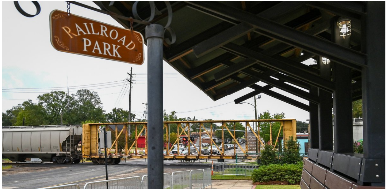
(Railroad Park in Ruston, Louisiana)