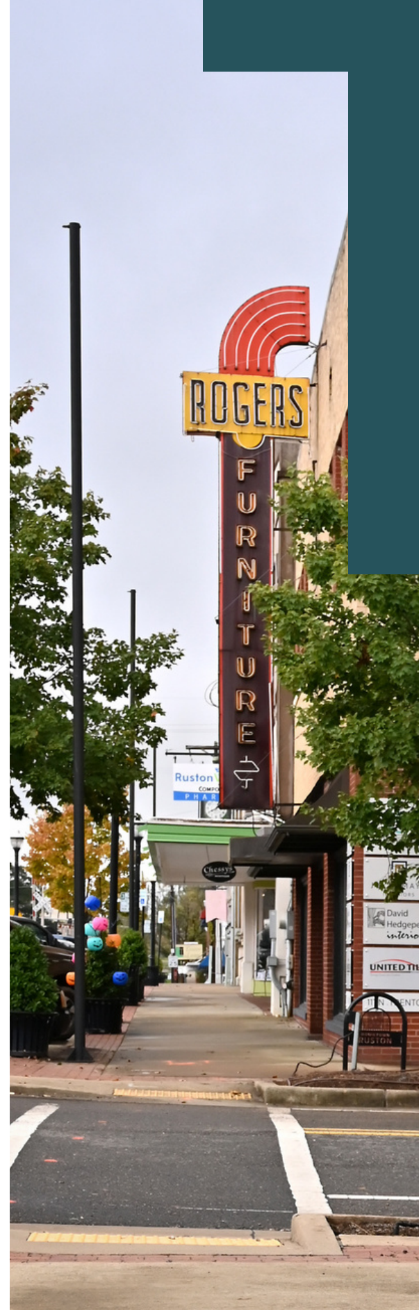
(Ruston, Louisiana;)