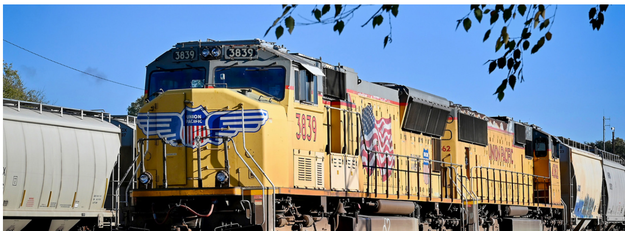
(Newport, Arkansas;)