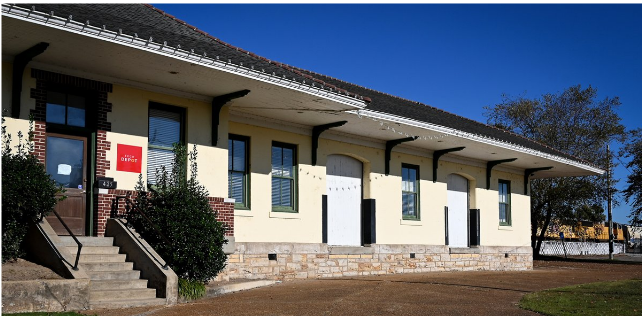
(Tech Depot in Newport, Arkansas; courtesy Rural Innovation Strategies, Inc.)

Another resource that higher education institutions offer in rural communities is a physical footprint: having available space, facilities, and a real presence within the community. Even though a significant amount of tech-based economic development can happen online, physical gathering locations as well as on-site technology and tools play a major role.