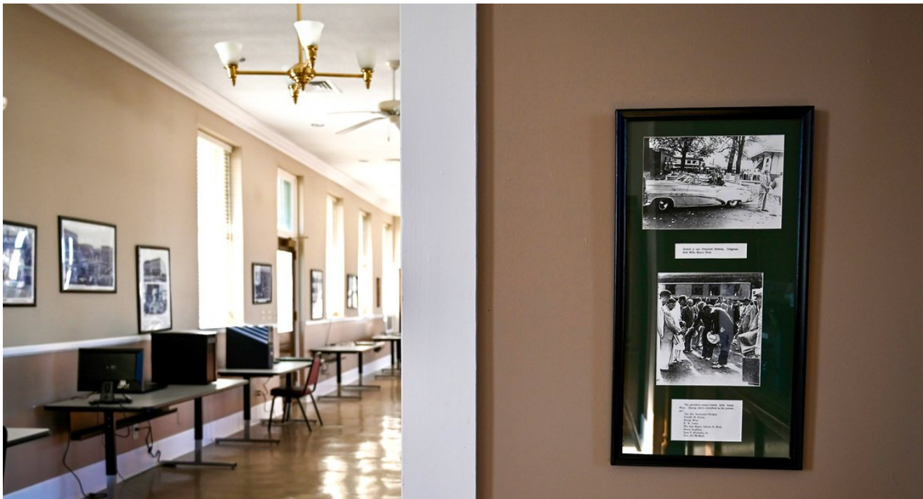
(Tech Depot in Newport, Arkansas)

Ruston and Newport are just two communities of many across the United States that exemplify how institutions of higher education can play into the development of digital economy ecosystems and the evolution of tech-based economic development in rural communities.