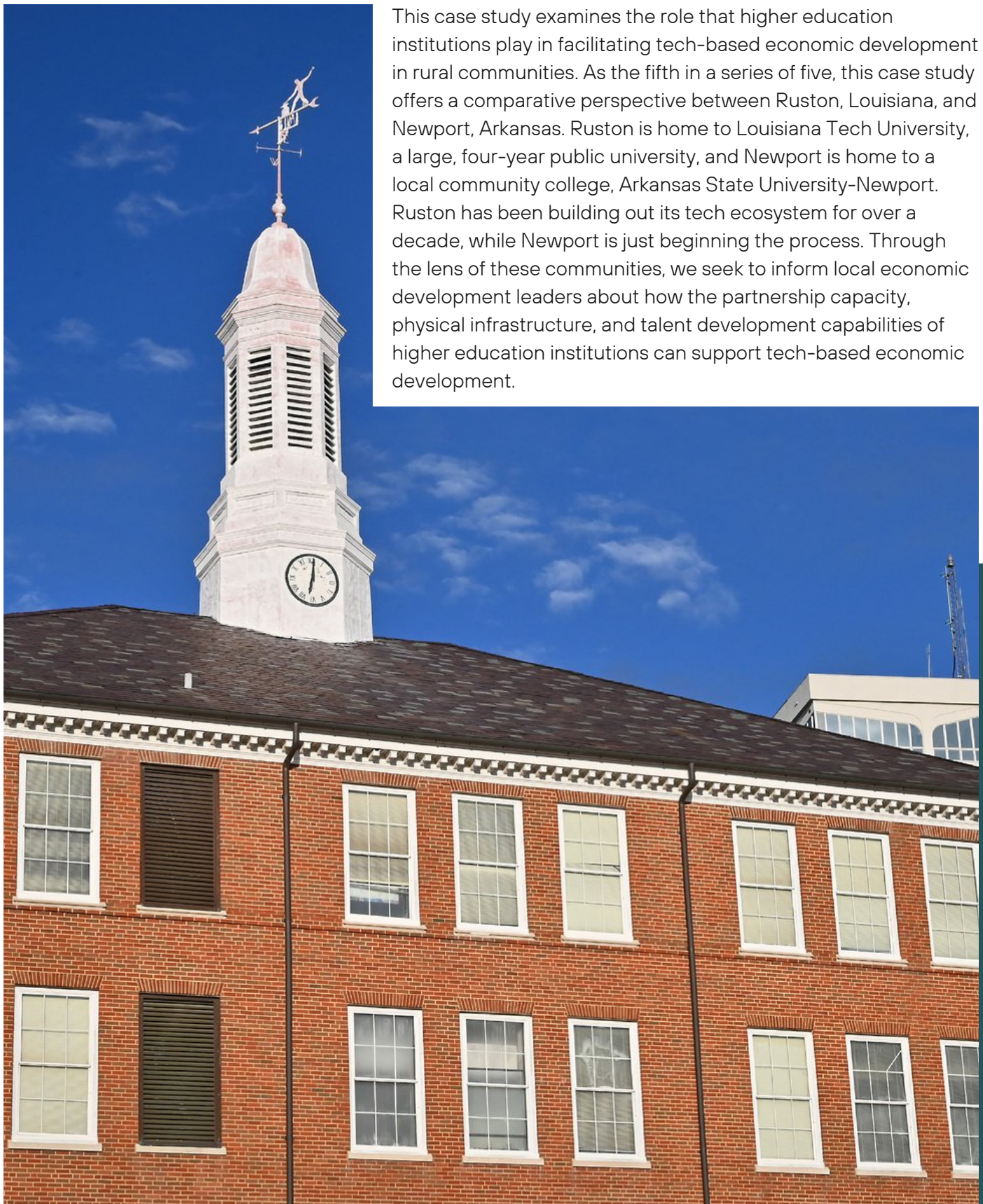
(Louisiana Tech University in Ruston, Louisiana;)

This case study examines the role that higher education institutions play in facilitating tech-based economic development in rural communities. As the fifth in a series of five, this case study offers a comparative perspective between Ruston, Louisiana, and Newport, Arkansas. Ruston is home to Louisiana Tech University, a large, four-year public university, and Newport is home to a local community college, Arkansas State University-Newport. Ruston has been building out its tech ecosystem for over a decade, while Newport is just beginning the process. Through the lens of these communities, we seek to inform local economic development leaders about how the partnership capacity, physical infrastructure, and talent development capabilities of higher education institutions can support tech-based economic development.