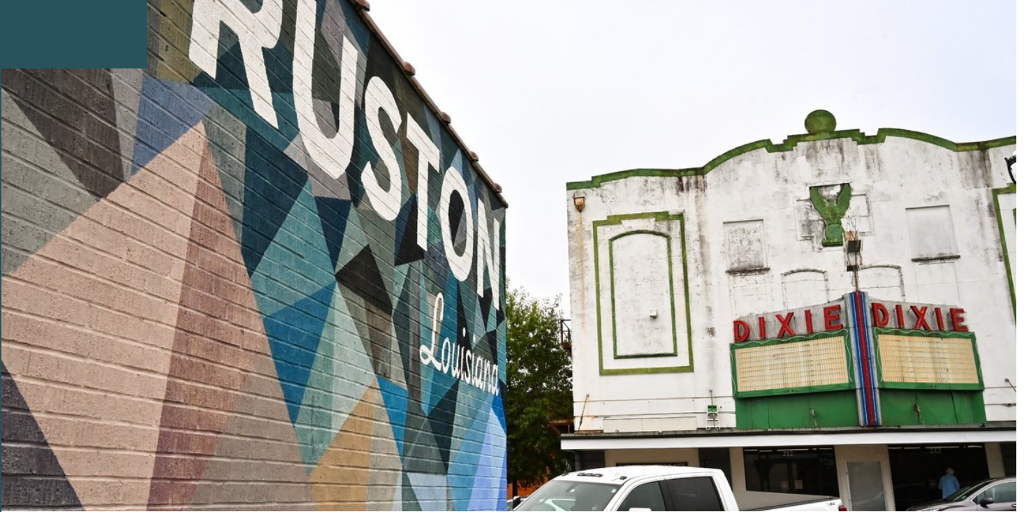
(Ruston, Louisiana;)