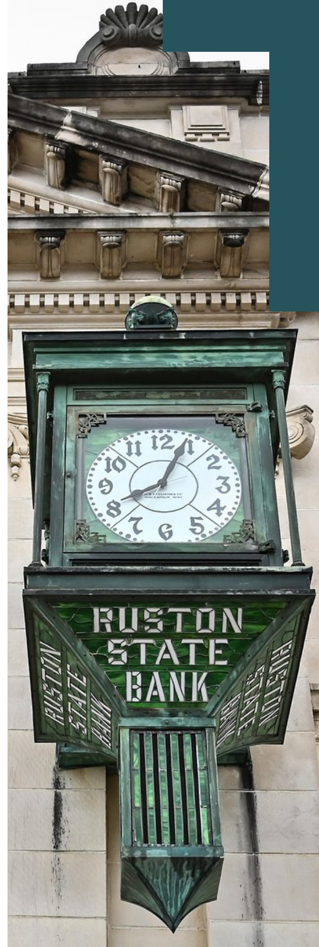
(Ruston State Bank in Ruston, Louisiana)

This case study is part of a larger series intended to illustrate the array of possible ways that digital economy ecosystems can be constructed in rural America. Although the focus offers a comparison between two small, rural cities, the lessons learned in Ruston and Newport on the value of higher education institutions are applicable to rural communities across the country.