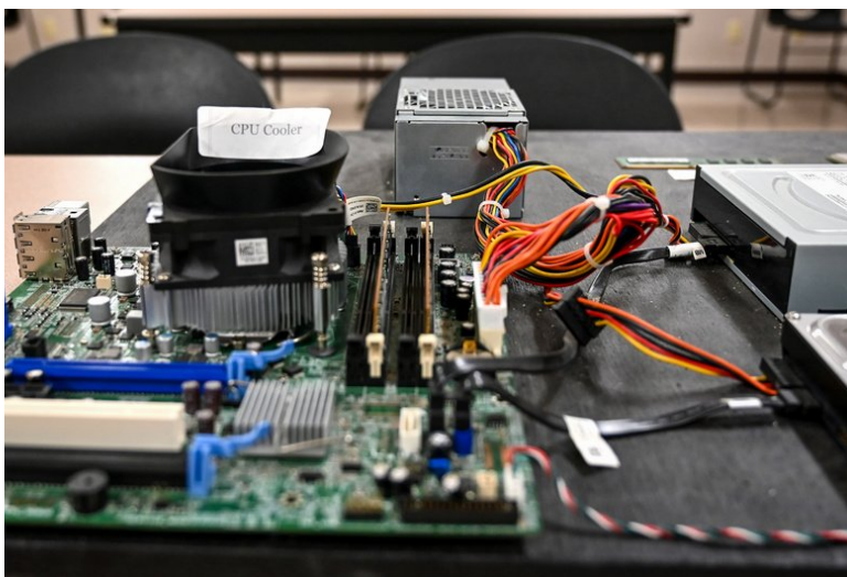
(Arkansas State University-Newport in Newport, Arkansas;)