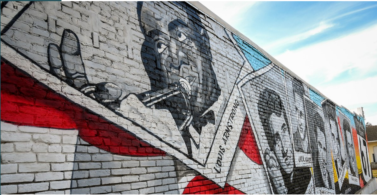
(Rock N' Roll Highway 67 Mural in Newport, Arkansas; courtesy Rural Innovation Strategies, Inc.)