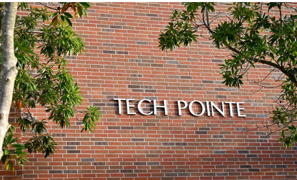
(Tech Pointe, Louisiana Tech University in Ruston, Louisiana)